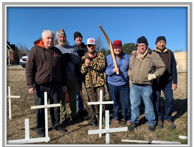
This motley crew of mostly Knight of Columbus members, through all kinds of inclement weather, spends hours each year skillfully placing 500 crosses in perfect alignment.